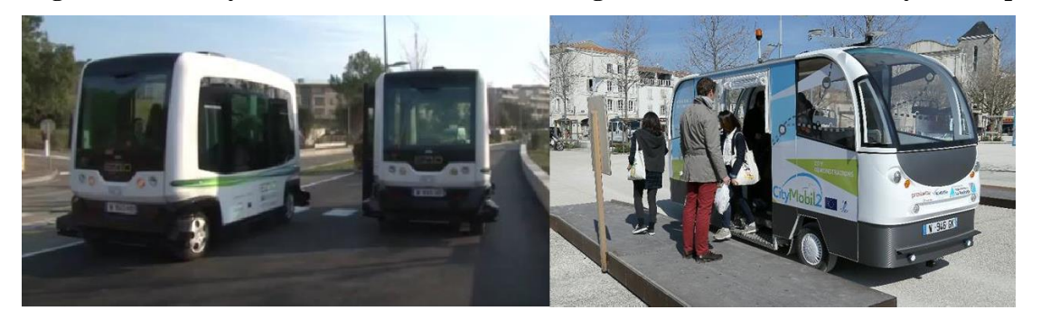
Figure 2. The EasyMile (left) and ROBOSOFT (right) vehicles used in the CityMobil2 project