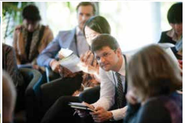
1. Nobel laureate and Summit keynote speaker Amartya Sen in the focus of media attention